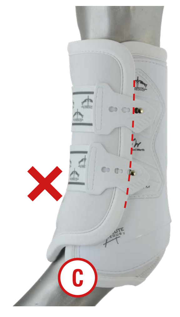
AD size too big. Excessive overlapping