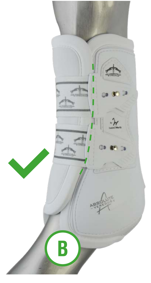
AD size correct overlapping