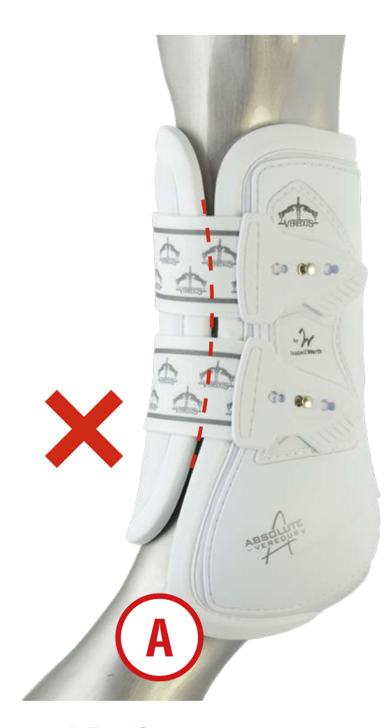
AD size too small